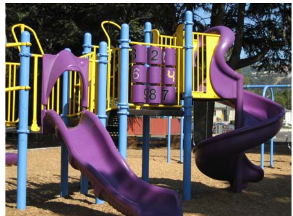
Maintain Over 300 Facilities, 134 Tot Lots, 5 Swimming Pools, 74 Basketball Courts and More