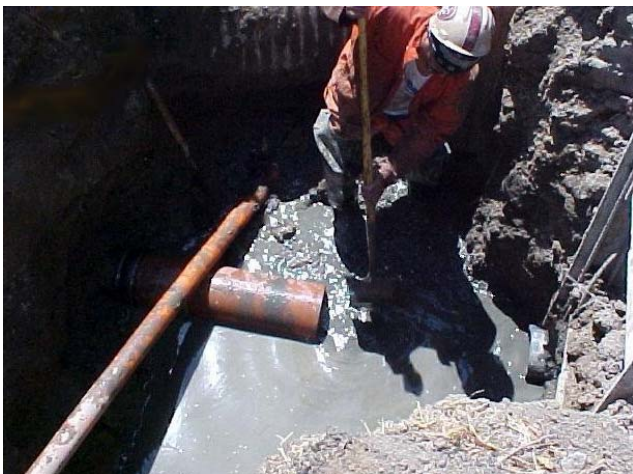
Sewer Main Repair at Shepherd Canyon