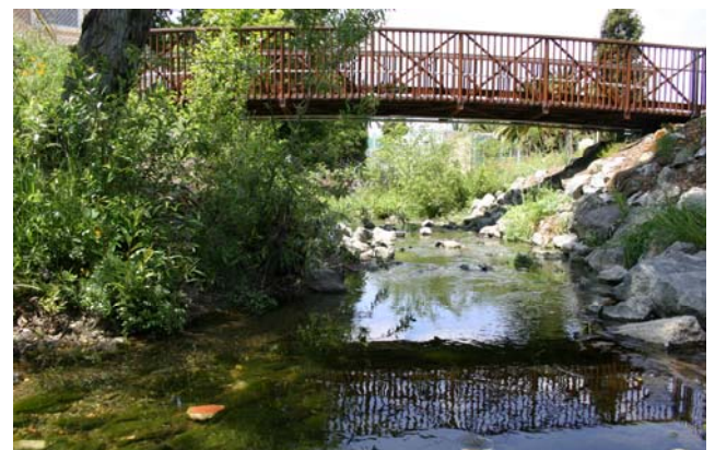
Oakland has over 40 miles of natural watercourse in 15 creeks and 30 tributaries