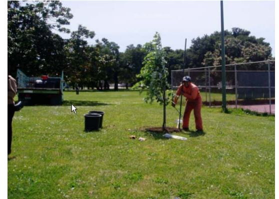
Over 1,000 Trees Planted Each Year