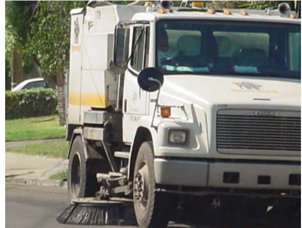
Street sweeping keeps streets cleaner and safer and helps reduce the amount of trash that enters our storm drain system, which flows into the San Francisco Bay