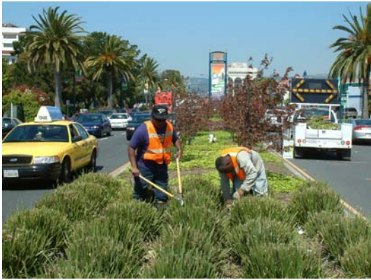
Hegenberger Road Median