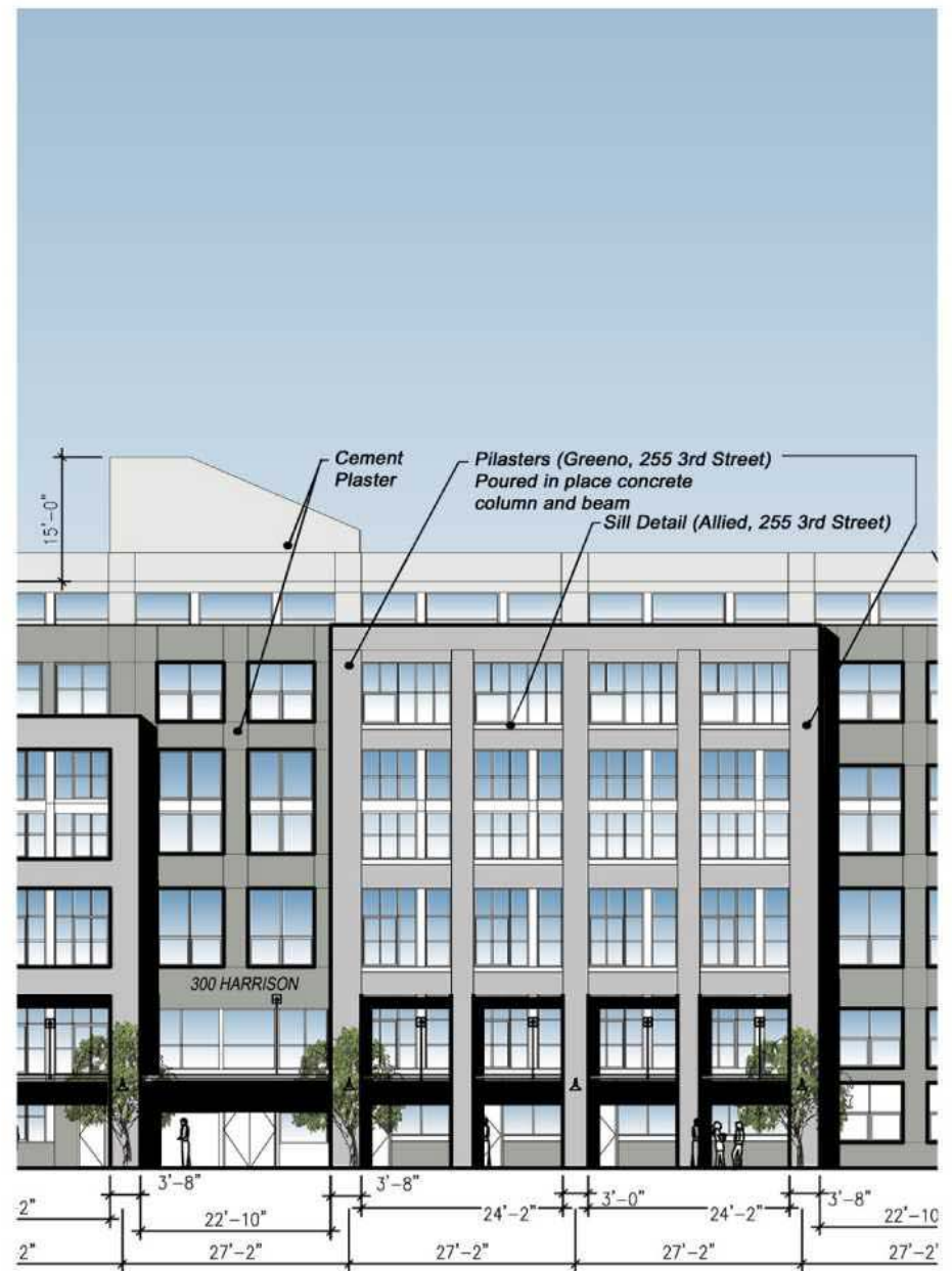
3RD STREET TYPICAL BAY