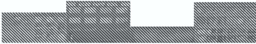
June 21 - 9am PDT

Note: Building in Shade - no new project-generated shadows