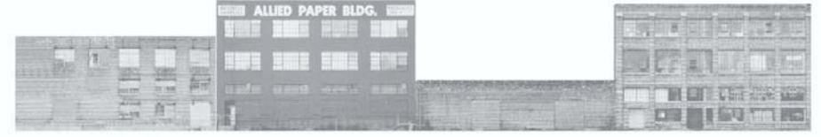
June 21 - 12pm PDT