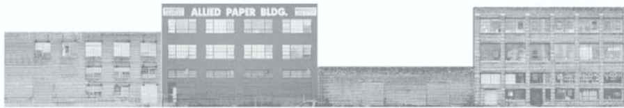
June 21 - 12pm PDT

Note: Building in Shade - no new project-generated shadows