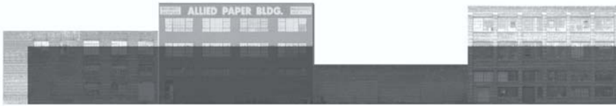
June 21 - 3pm PDT