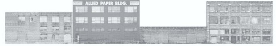
June 21 - 3pm PDT