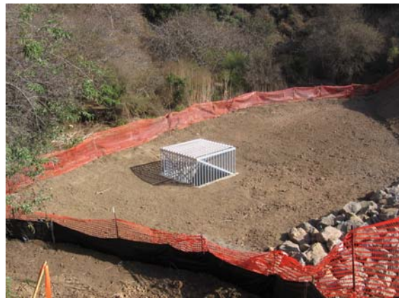
Ridgemont Basin overview