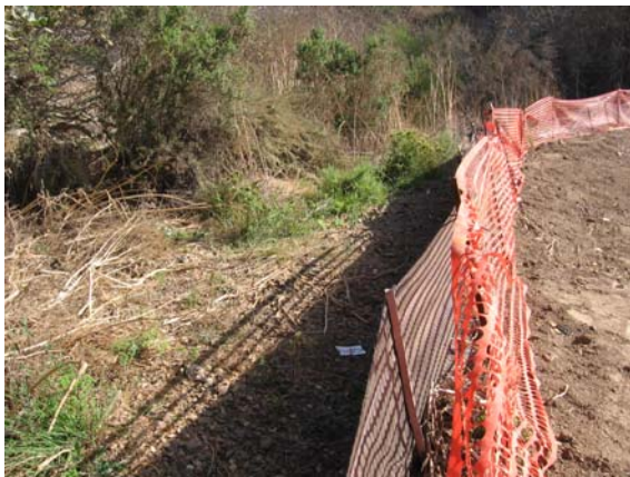
Fence line near swale

The fence in the Ridgemont basin was inspected for possible collapse from water accumulation from recent rains. The fence appeared to be in good condition at this time (see photos).